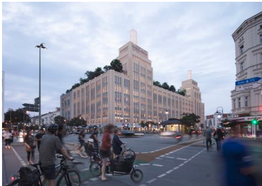
Karstadt at Hermannplatz. SIGNA, David Chipperfield Architects. Berlin, Building in planning.

What's left after the hype of the home office? What do office buildings need in order to function in the future as places of working together, dialogue, and learning? How to react on the rapid transformation in commerce? What are future-oriented concepts for large department stores? What will replace the social function of "analogue" shopping – and what about its sensual qualities? Do all these upheavals finally offer the possibility for more urban housing downtown? And what does that mean for the city as a whole? We complete day #1 with a dedicated perspective from Russia.