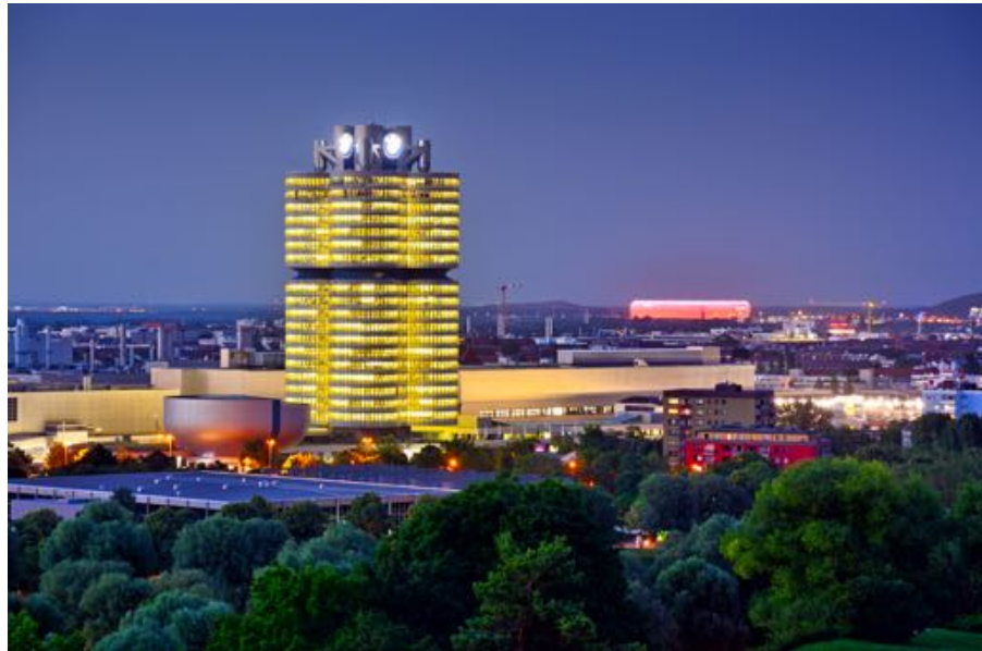
Munich at Night with the tower of the BMW Headquarters and the Allianz Arena