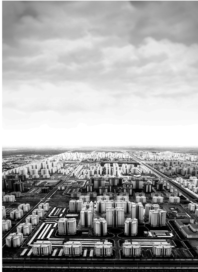
Kilamba New City, Luanda, Angola