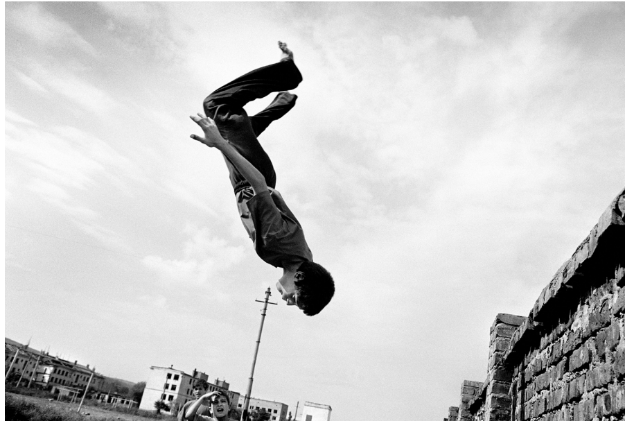
Boys playing, Chechnya 2004