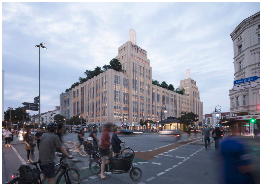
Karstadt at Hermannplatz. SIGNA, David Chipperfield Architects. Berlin, Building in planning.

What's left after the hype of the home office? What do office buildings need in order to function in the future as places of working together, dialogue, and learning? How to react on the rapid transformation in commerce? What are future-oriented concepts for large department stores? What will replace the social function of "analogue" shopping – and what about its sensual qualities? Do all these upheavals finally offer the possibility for more urban housing downtown? And what does that mean for the city as a whole? We complete day #1 with a dedicated perspective from Russia.