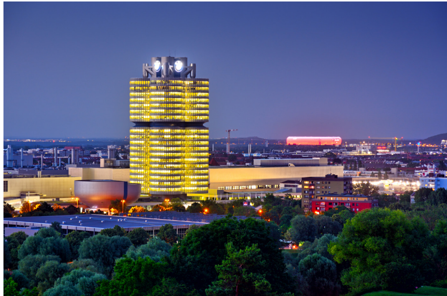
Munich at Night with the tower of the BMW Headquarters and the Allianz Arena