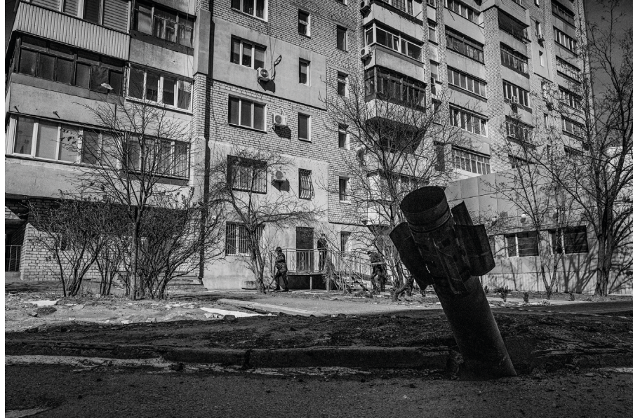
Mykolaiv, Ukraine