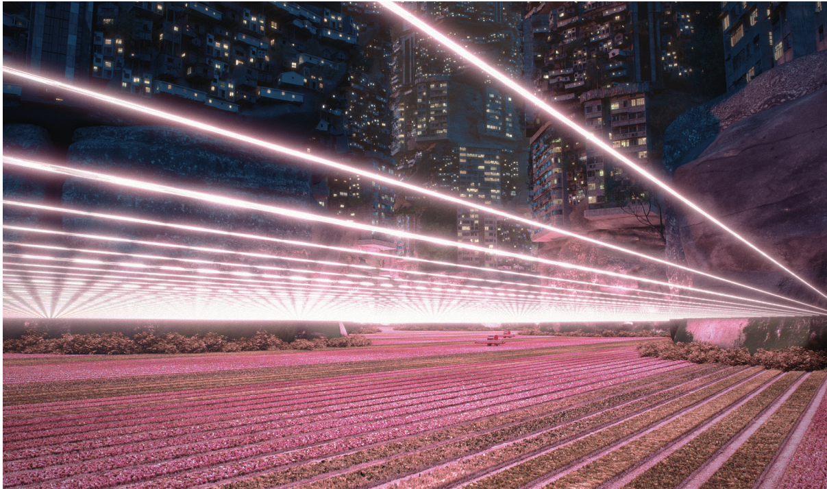
Planet City (A City for 10 Billion People), Liam Young, 2021