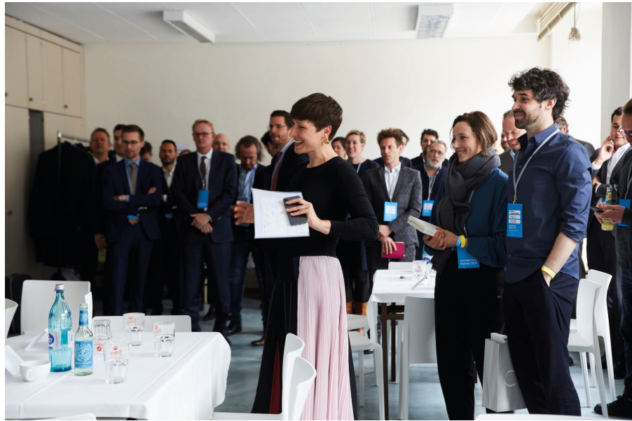
Architecture Matters 2019, Speed Dating

A central focus of Architecture Matters is stronger networking between the architecture and real estate industries – fostering dialogue at eye level. Our speed dating sessions bring ambitious (young) architects and potential clients into direct contact. Fresh, contemporary ideas shake up conventional planning approaches to reveal new possibilities.